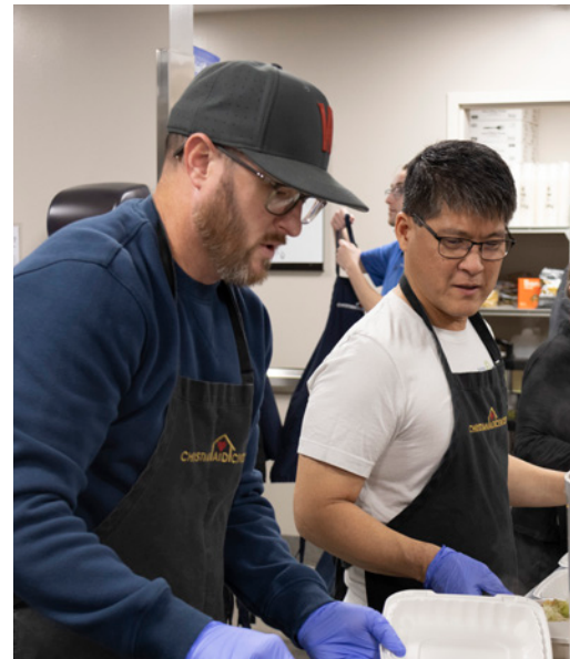
Baker Boyer employees regularly volunteer at the Christian Aid Center throughout the year to plan, shop for, cook, and serve dinners for those in need.