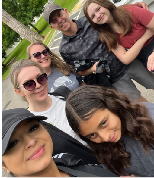
Walla Walla employees and their families volunteered to clean up the area along Myra Road which perimeters Rempel Nature Trail inside the Fort Walla Walla Natural Area.