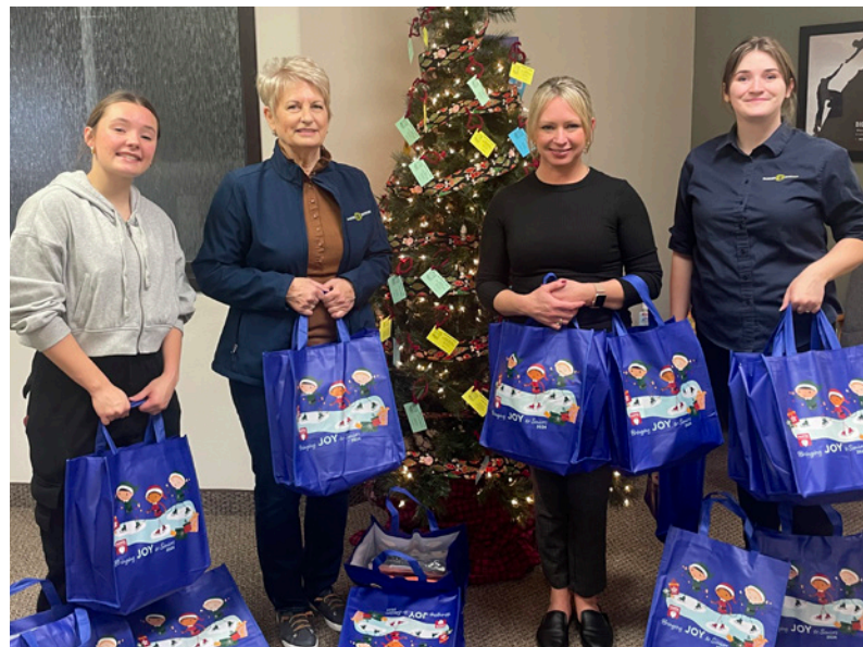
Kennewick employees volunteered with Meals on Wheels through Senior Life Resources Northwest, packing over 900 bags to deliver nutritious meals and support to seniors in our community.