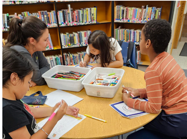
In partnership with 21st Century Learning, the Finance Academy by Baker Boyer visited Prospect Point to help first through fifth graders learn about finance.